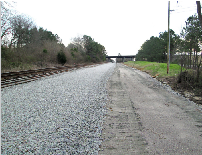
Ballast pad for siding tracks