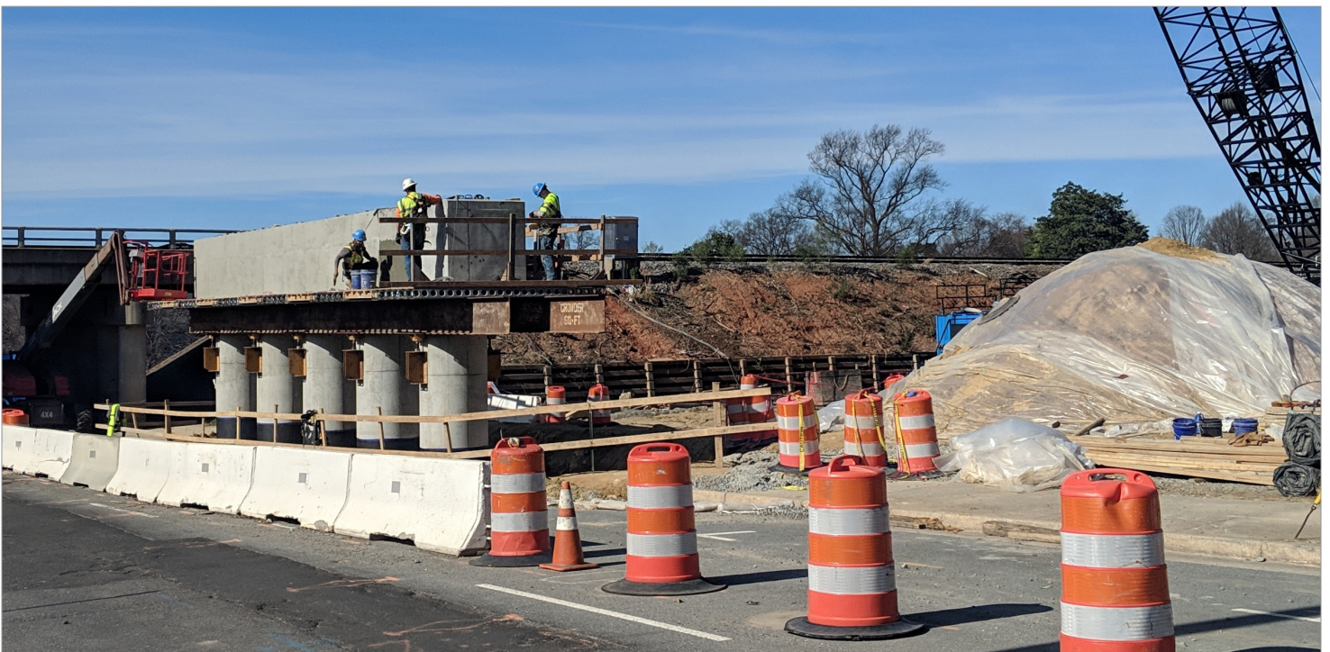
Fifth Street bridge pier that will support the new tracks serving the station