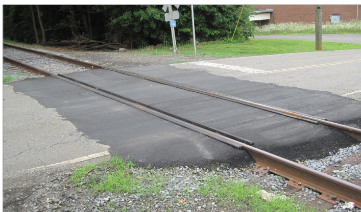
Nelson Street after improvements