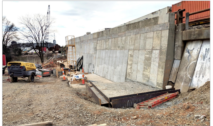
Completion of concrete work on railroad retaining wall north of 6th Street