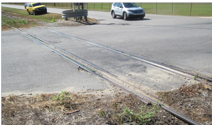
First Street before improvements