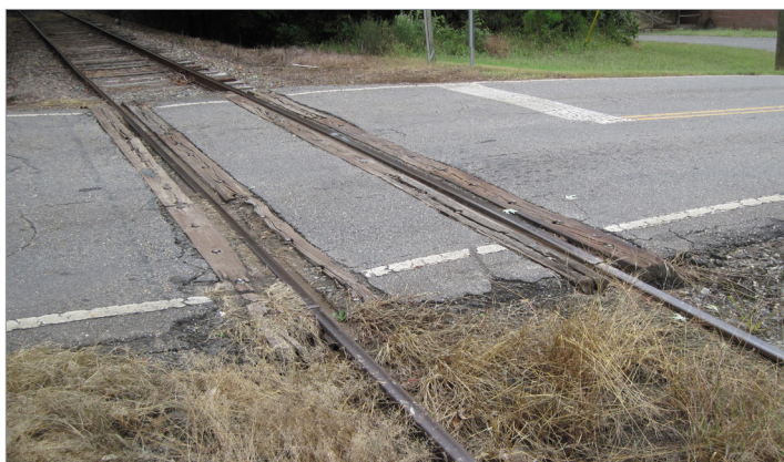
Nelson Street before improvements