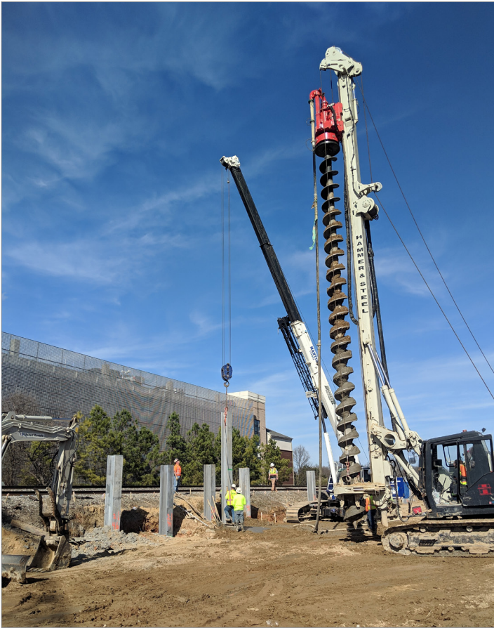
Drilling and setting of piles for new retaining wall between 5th Street and Trade Street