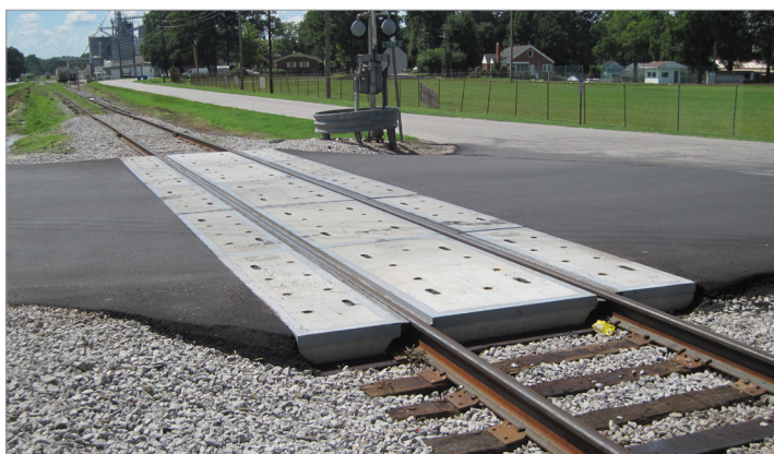
First Street after improvements