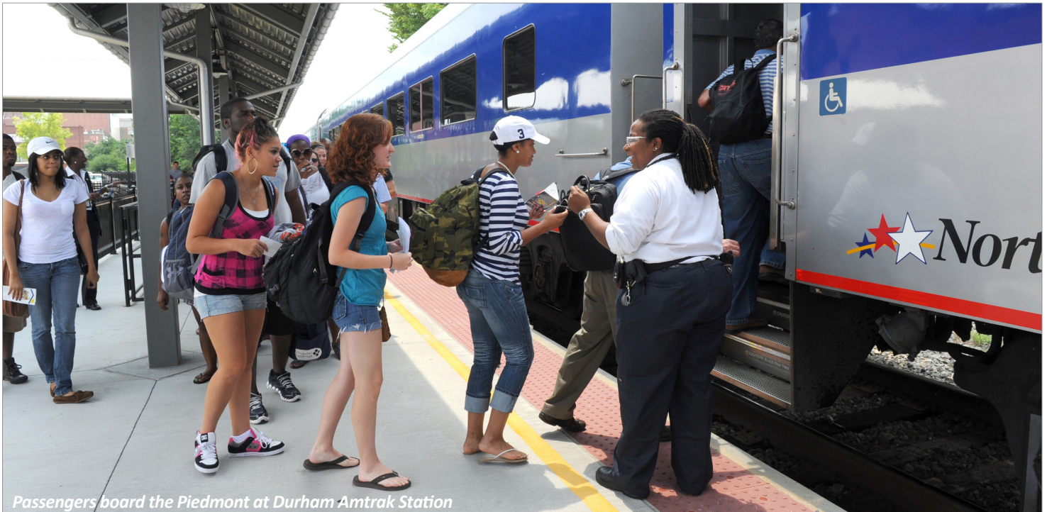
Passengers board the Piedmont at Durham Amtrak Station

Each month a percentage of passengers are surveyed on their experience while traveling on one of the 29 Amtrak-operated state supported trains across the country. The Piedmont trains took the top score for November and December 2018.