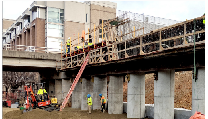
Forming work for cap on new bridge pier at Trade Street