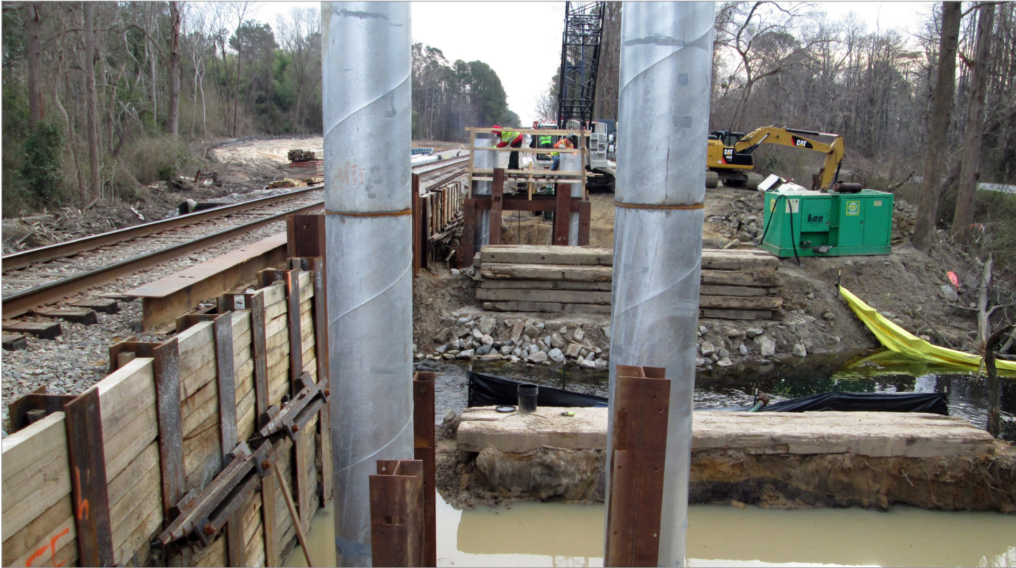
Bridge work and ballast pad construction

capacity. Manual switches are being replaced with self-restoring switches to reduce the time trains must occupy mainline track. The construction of a new railroad bridge is included in the project. Grading work is nearing completion and bridge work ongoing. A ballast pad has been installed. The track contractor is tentatively set to begin track construction this spring.