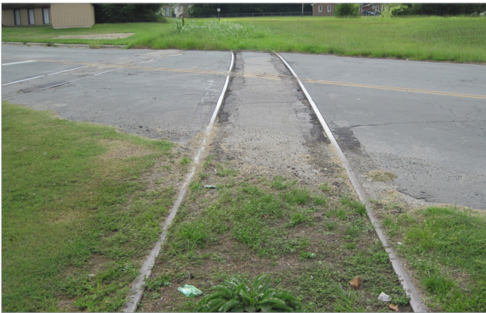
West Morisey Boulevard crossing before improvements