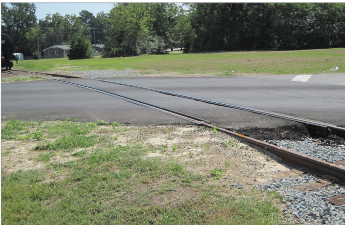
West Morisey Boulevard crossing after improvements