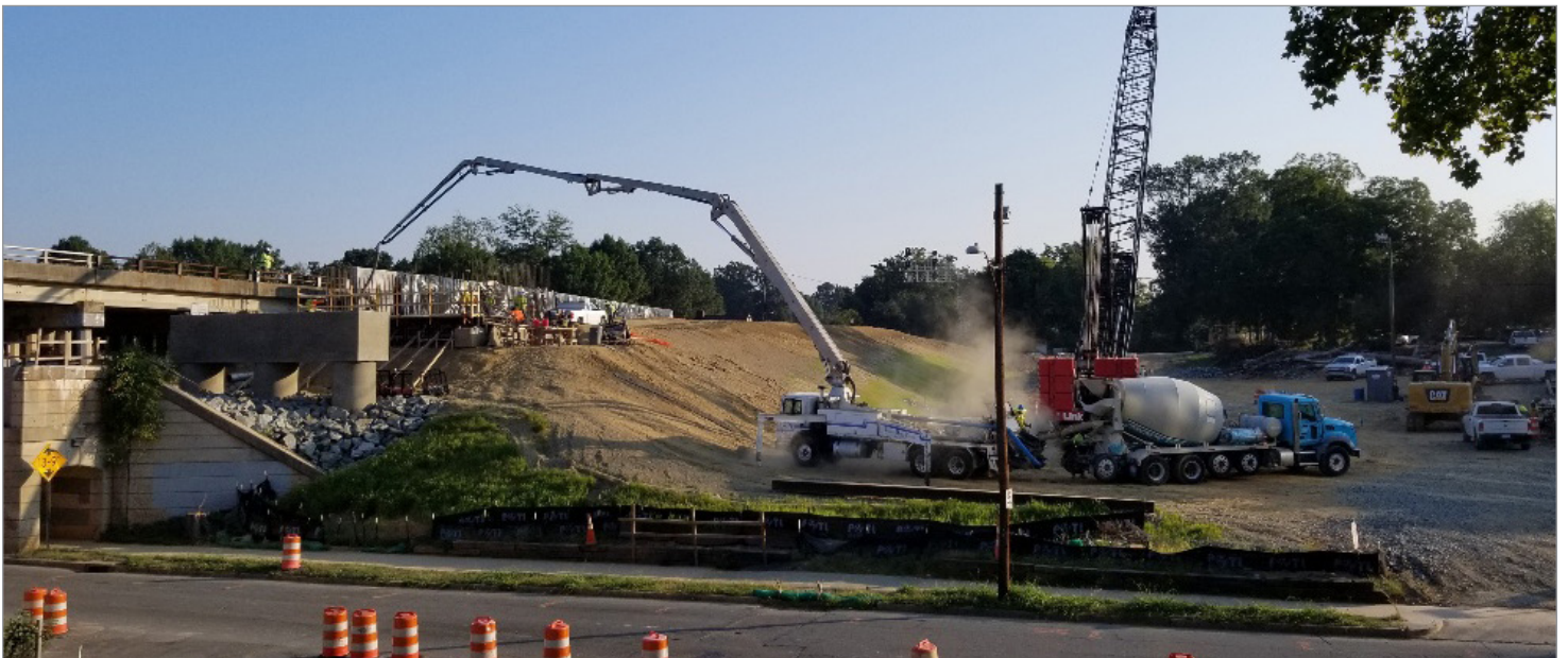
6th Street bridge pour