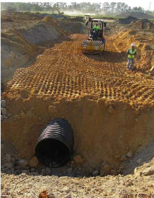
Terminal site looking west - HPDE Pipe Installation