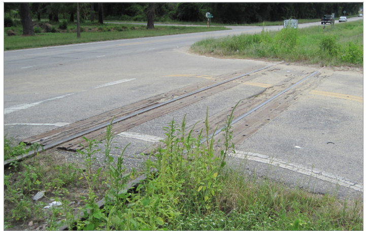
Rackley Road crossing before improvements