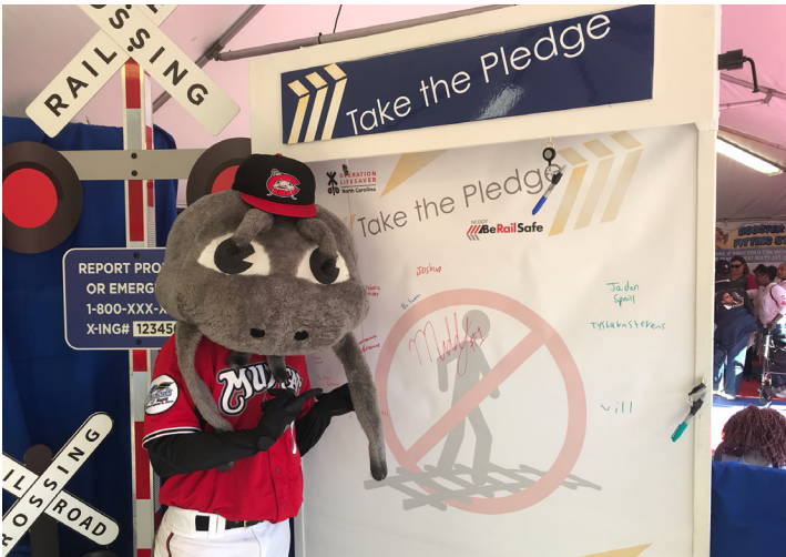
Muddy, mascot of the Carolina Mudcats, takes the pledge to BeRailSafe