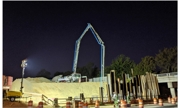
4th Street bridge foundation pour