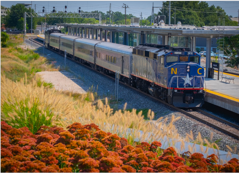
The Piedmont awaits passengers at Raleigh Union Station