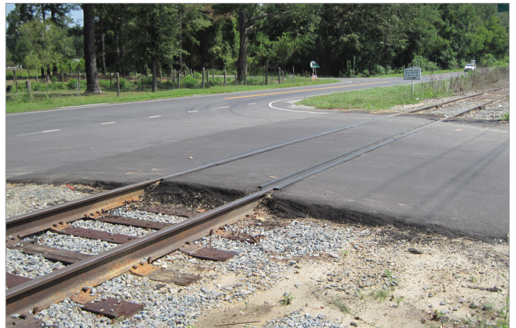
Rackley Road crossing after improvements