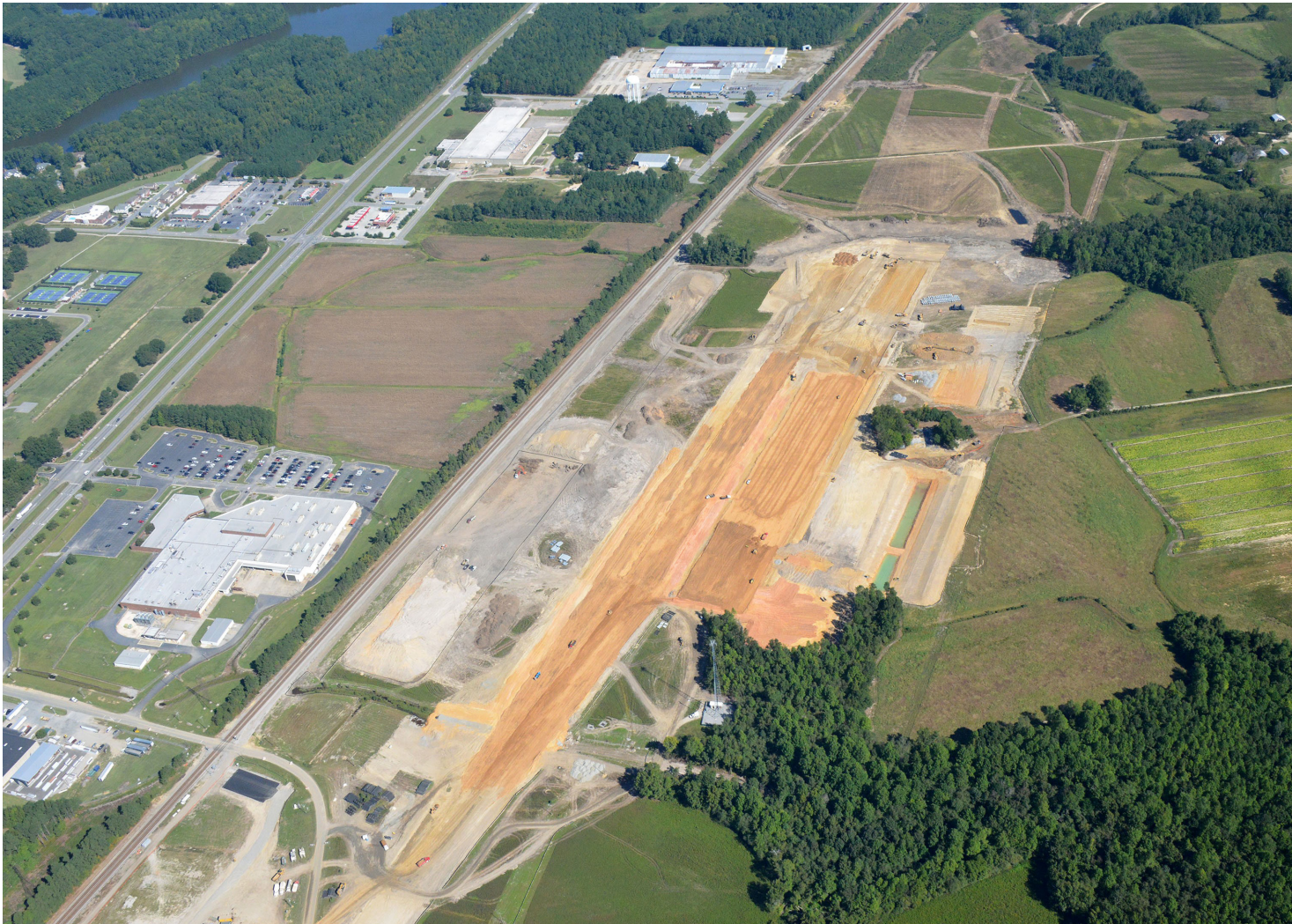
Aerial view of north half of site