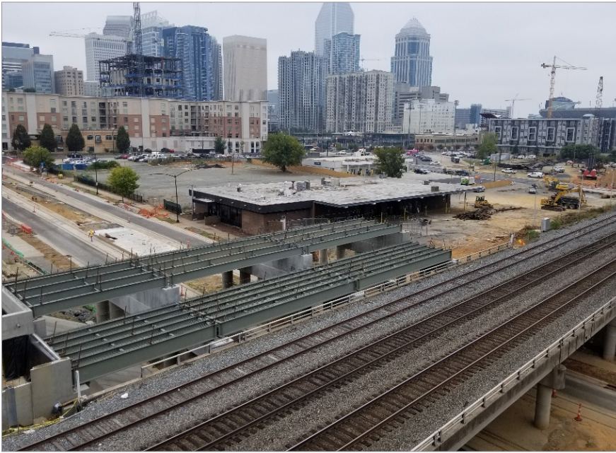
Bridge construction at Trade Street