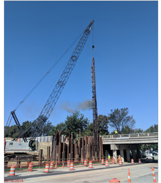
4th Street bridge piles