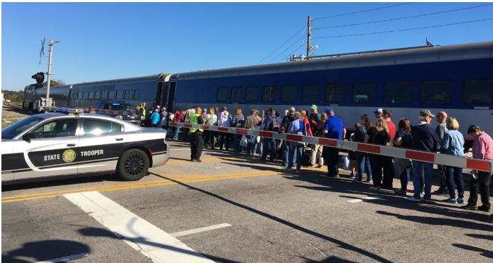
State fair attendees enjoyed the convenience of the special NC By Train State Fair stops again this year

November Trivia Question: Which North Carolina train station built in 1926 was recently restored and what purpose does the station now serve? See answer on page 7.