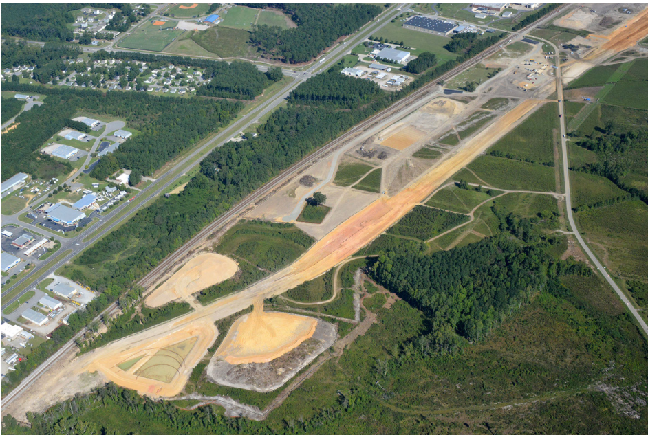
Aerial view of south lead track