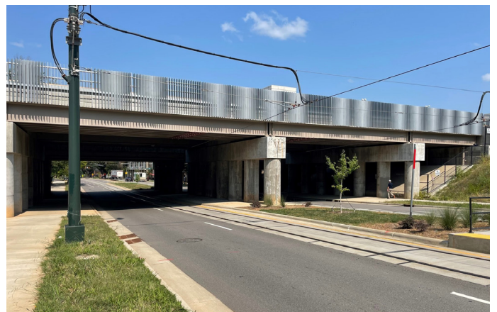
Trade Street bridge