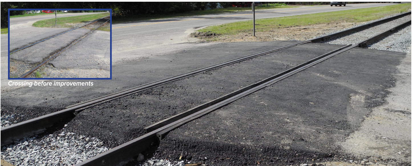
Crossing before improvements

The Arnette Street crossing near Aberdeen previously had only asphalt for the crossing surface with no flangeway material. The asphalt was sinking and deteriorating, creating a rough crossing. This was replaced with rubber rail seal and asphalt, providing a smooth and safer crossing for the residents on this street. The Aberdeen Carolina & Western Railway, NCDOT Moore County Maintenance and the Rail Division worked together on this crossing improvement.