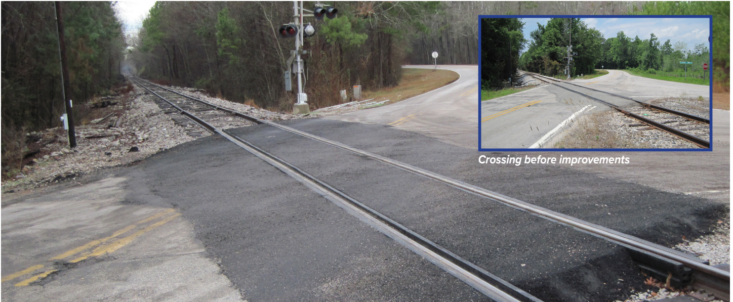
Crossing before improvements