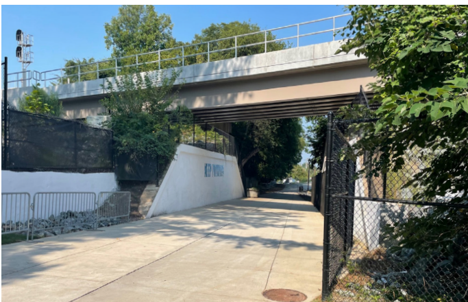
P&N Bridge with pedestrian underpass