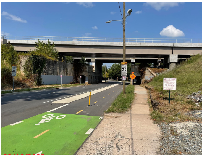
6th Street bridge