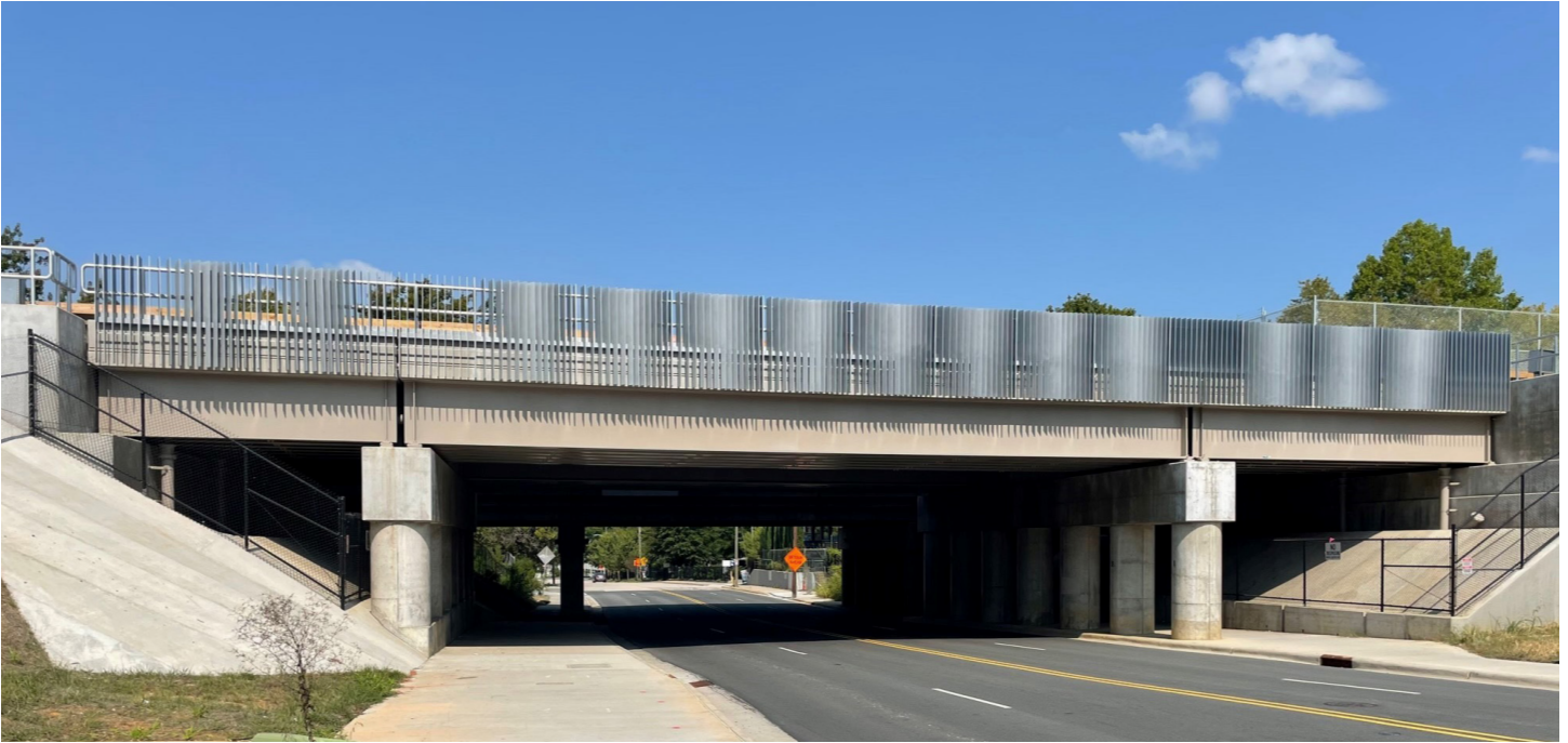
4th Street bridge

Charlotte Gateway Station Phase I included construction of five bridges to elevate the tracks and platform above 4th, 5th, 6th and Trade streets and a pedestrian walkway.