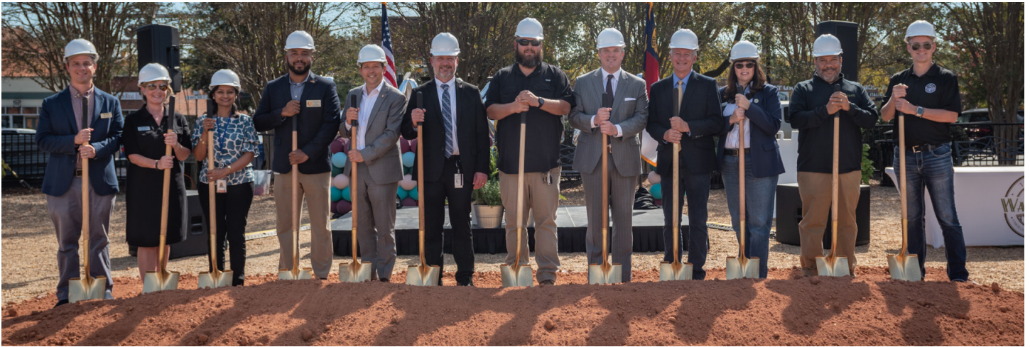
NCDOT, Town of Waxhaw, Union County and CSX officials celebrate the beginning of a rail safety improvement project in Waxhaw.

This first of a series of projects to improve freight movement and rail safety between Wilmington and Charlotte broke ground in October. Funded by the state STIP and a federal CRISI grant, the Waxhaw Rail Safety Improvement Project will extend a passing siding and construct a new roadway grade separation at Helms Road.