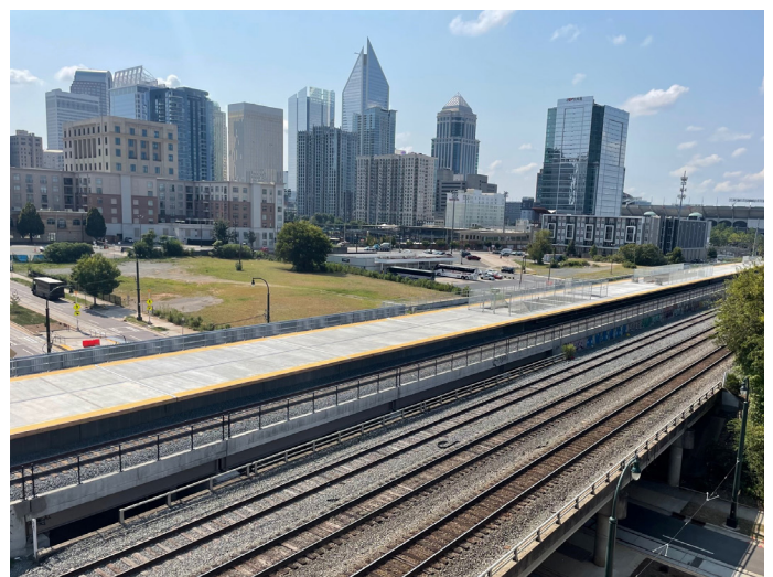
Tracks and platform over Trade Street