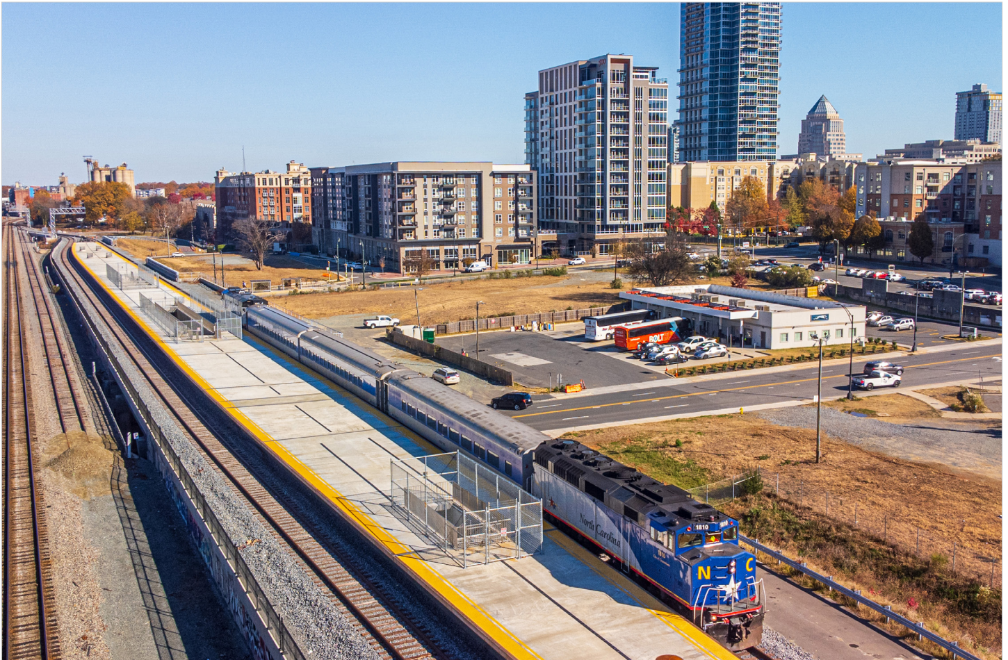
Test run of the first Piedmont train on the newly completed Charlotte Gateway tracks and platform