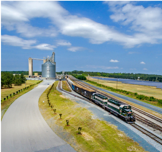
Aberdeen Carolina and Western Railway

Multiple short line railroads will be improving their rail infrastructure thanks to approximately $12 million in grant funds being awarded by the N.C. Department of Transportation in December. This follows a May 2022 announcement of nearly $11 million in awarded projects to short lines under the same program.