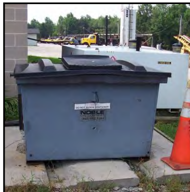
Used oil filter dumpster stored outside an NCDOT Equipment Shop

Additionally, the State of North Carolina does not consider used oil filters to be a hazardous waste IF the filters are non terne-plated and the used oil is removed from the filter by gravity draining, crushing, disassembly, or air pressure. If one of these methods is performed, the used oil filters can be disposed of as non-hazardous solid waste, subject to local requirements. Used oil filters that are not drained by one of the above methods and/or are terne-plated must be managed as hazardous waste. Terne is an alloy of lead and tin, and the lead in terne plating can make a used oil filter hazardous. Terne-plated filters are used more commonly with heavy-duty vehicles and trucks.