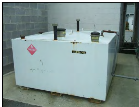
Used oil AST is double-walled