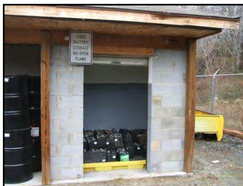
Used batteries stored on spill containment pallet inside building