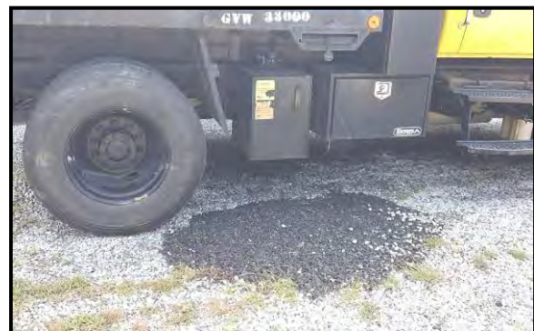
Hydraulic oil leak from NCDOT truck