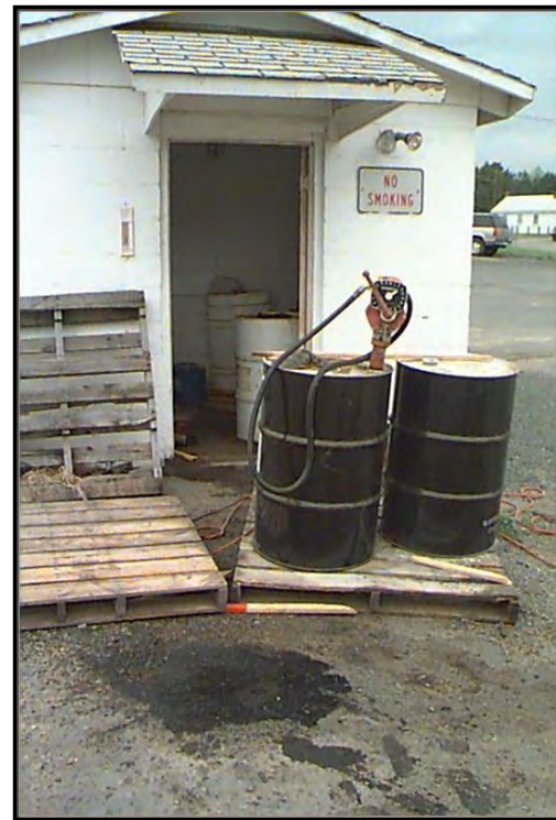
Stained pavement from spills outside drum storage/dispensing area