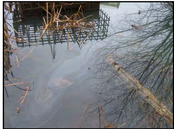
Oil sheen on surface water