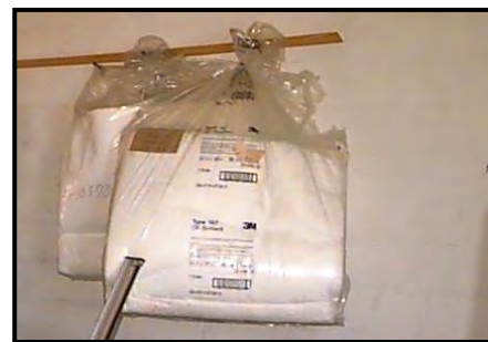
Absorbent pads stored on-site for spill response