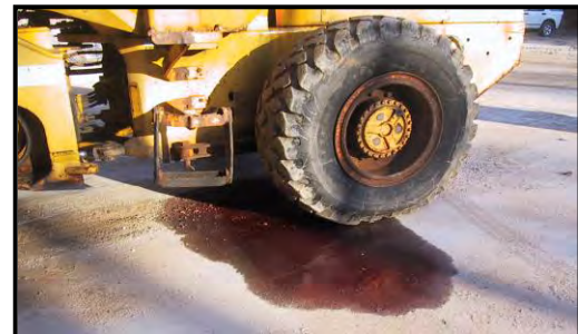
Hydraulic fluid spill on pavement from heavy equipment