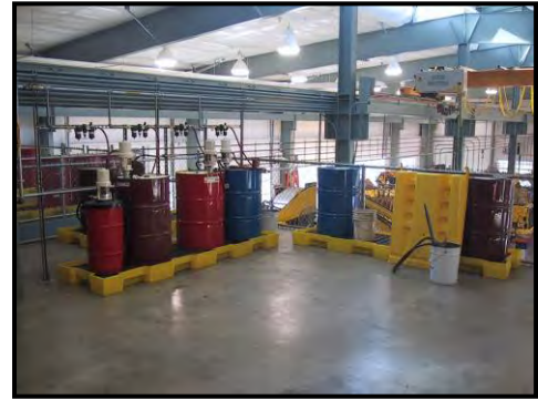
Drums of oil and hazardous substances stored on secondary containment pallets inside an NCDOT Equipment Shop