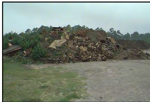
Construction & Demolition waste stockpile located at an NCDOT facility