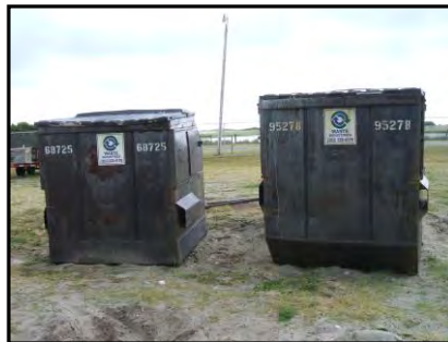
Solid waste dumpsters with closed lids