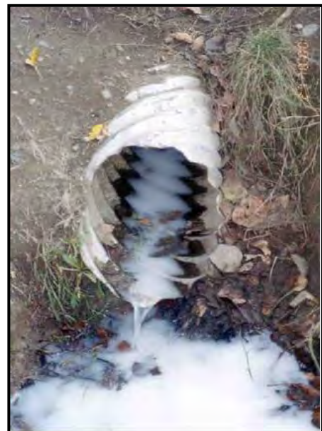
Paint spill discharged to the storm drainage system