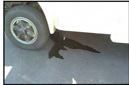
Antifreeze leak on pavement from NCDOT truck