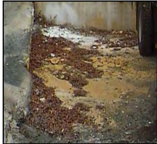
Paint spills on the ground from improper loading and mixing practices