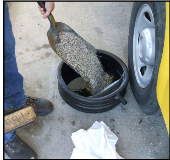
Sweep up dry absorbents