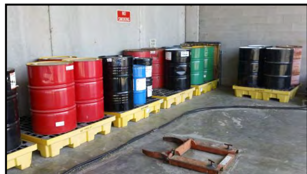
Drum storage areas should be visually inspected daily