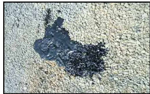
Liquid asphalt spilled on ground near dispensing area