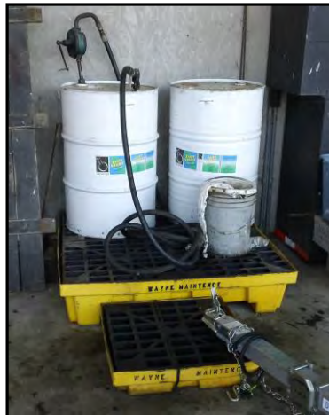
Asphalt release agent drums used to clean equipment [Note: excess cleaning product should be revised or properly disposed]