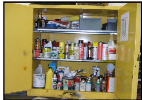
NCDOT self-contained flammables cabinet used to store HAZMATs