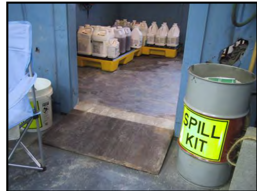
HAZMATs stored indoors on spill containment pallets with a spill response kit containing absorbents located nearby

NCDOT bulk aboveground storage tanks containing hazardous materials should be labeled with the contents, capacity, hazard, and an emergency telephone number, as appropriate.