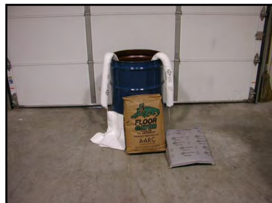
Typical NCDOT spill kit