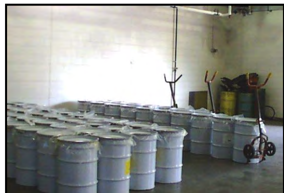
New paint drums stored indoors in NCDOT Traffic Services Shop