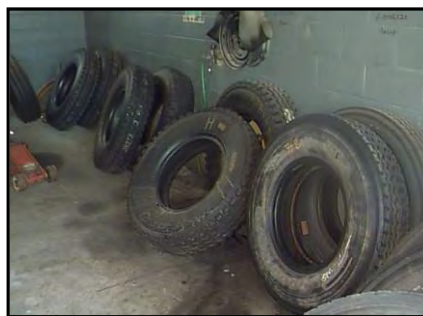
Scrap tires stored indoors at an NCDOT Equipment Shop