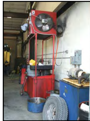
Used oil heater located in an NCDOT Equipment Shop