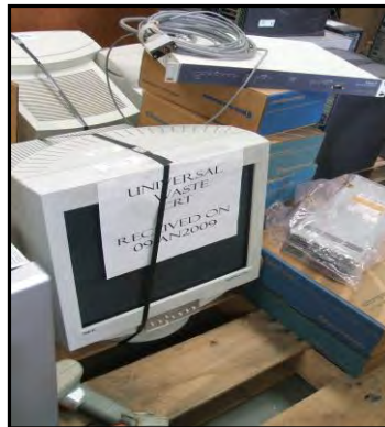
Electronic Waste labeled as Univesal Waste