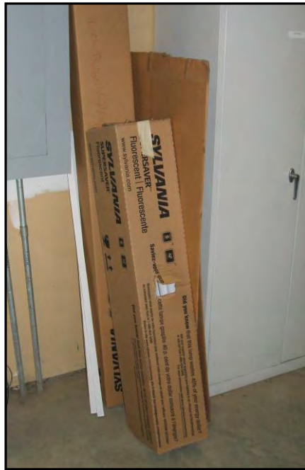
Universal Waste – used fluorescent bulbs stored in original containers