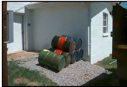
Empty drums stored horizontally on ground [Note: No cover or signage is provided]

Regarding the management of empty drums, note the following BMPs: