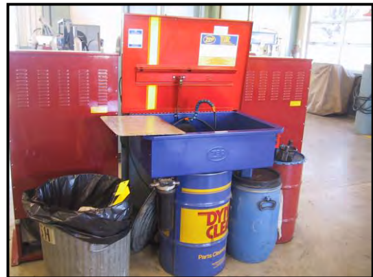
Solvent parts cleaner located in NCDOT Equipment Shop