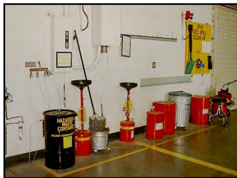
Hazardous waste satellite accumulation point [Note: Non-DOT facility]