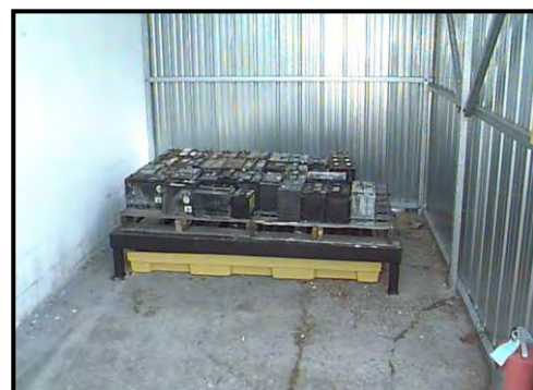
NCDOT batteries stored under cover on secondary containment pallet