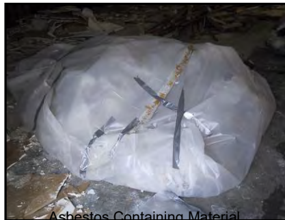
Asbestos Containing Material placed in plastic bags