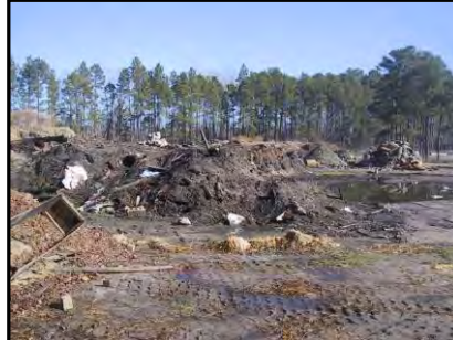
Land Clearing Waste stockpile located at an NCDOT facility