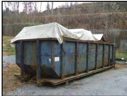
Scrap metal container covered with tarpaulin