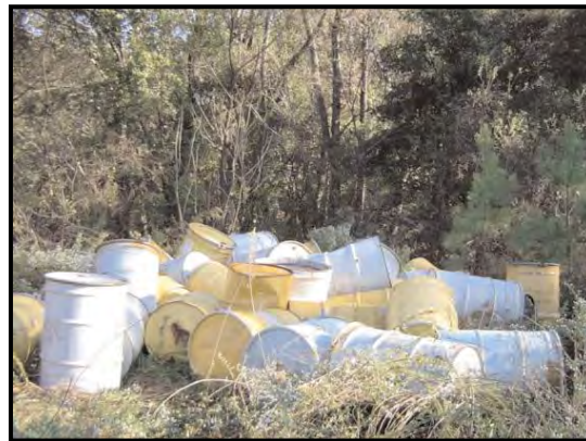
Drums abandoned onto NCDOT property are considered illegal dumping