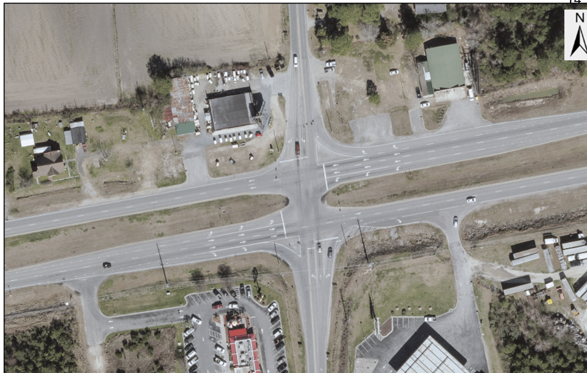
35 FIGURE 3 Aerial View of US 17 at NC 904 (17)

4 5 The locations span across five Divisions in North Carolina and cover the coastal plain, 6 piedmont, and mountain regions. The main line posted speed limits range from 45 mph to 60 7 mph. The 2011 AADT for the mainline approaches range from approximately 4,700 to 29,500 8 vehicles per day. The mainline cross sections vary, but a majority are four-lane divided 9 facilities. DARE was installed at the pilot sites between January and October 2013. Both 10 mainline approaches were treated at most sites but two sites were treated on only one mainline 11 approach. It is important to note that no public relations announcements accompanied the 12 installations. All sites currently remain in operation. Figure 3 provides the aerial view for the 13 intersection of US 17 at NC 904, which is representative of the pilot study locations.