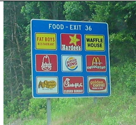
b) 9-Panel Sign