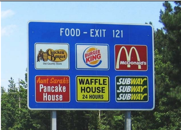
a) 6-Panel Sign (current standard)