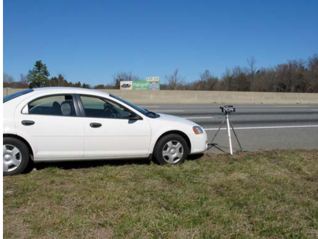
Figure 3. Video Camera Placed in Front of Parked Vehicle

A Sony Digital Handycam DCR-VX2000 camcorder using 60-minute MiniDV tapes was used to record driver behaviors. One hour of video was recorded for each site. Traffic volume was counted by individual lanes during this hour. For sites with more than two lanes in the direction of interest, only the two rightmost lanes were included in volume counts and subsequent data reduction. Drivers who were concerned with exiting for food would presumably be in one of these two lanes.