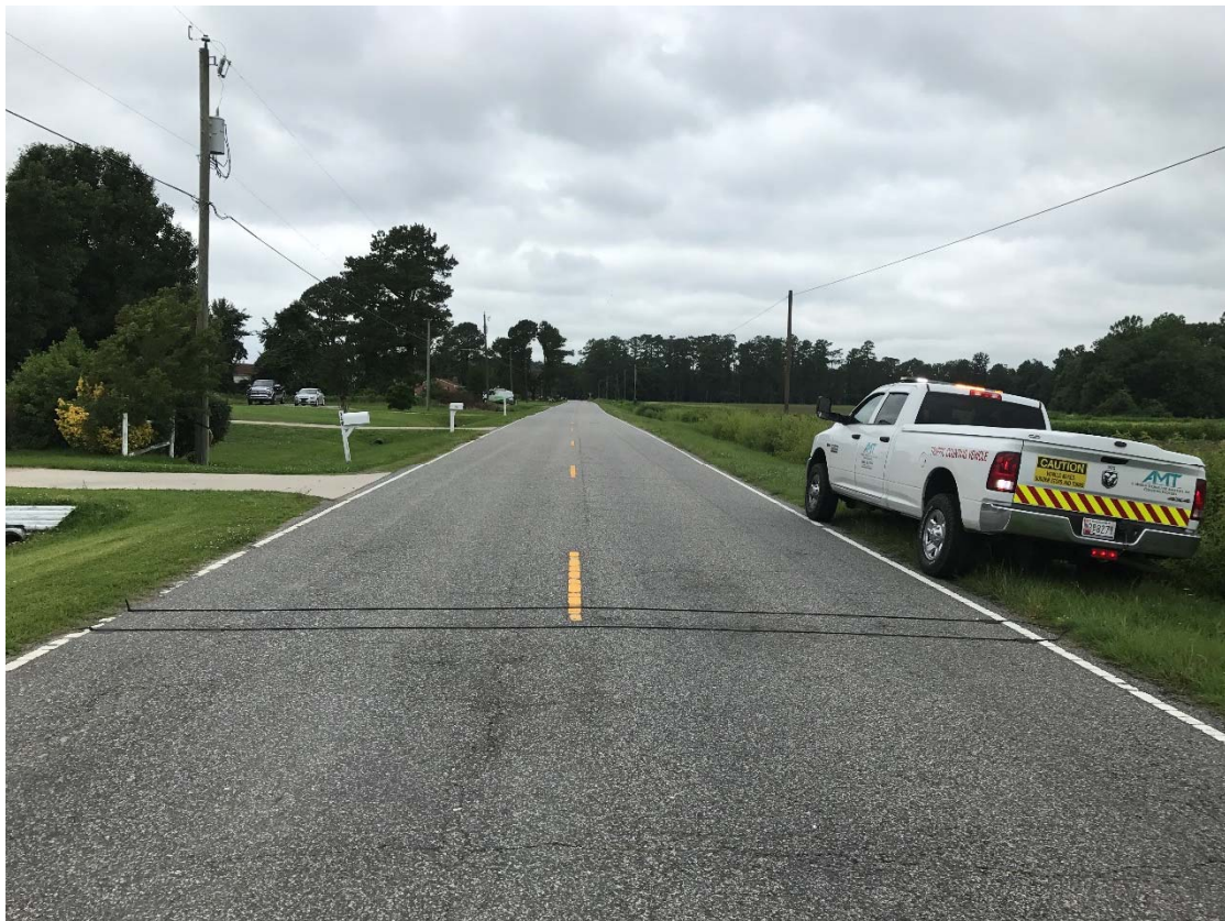
Looking in the Westbound Direction