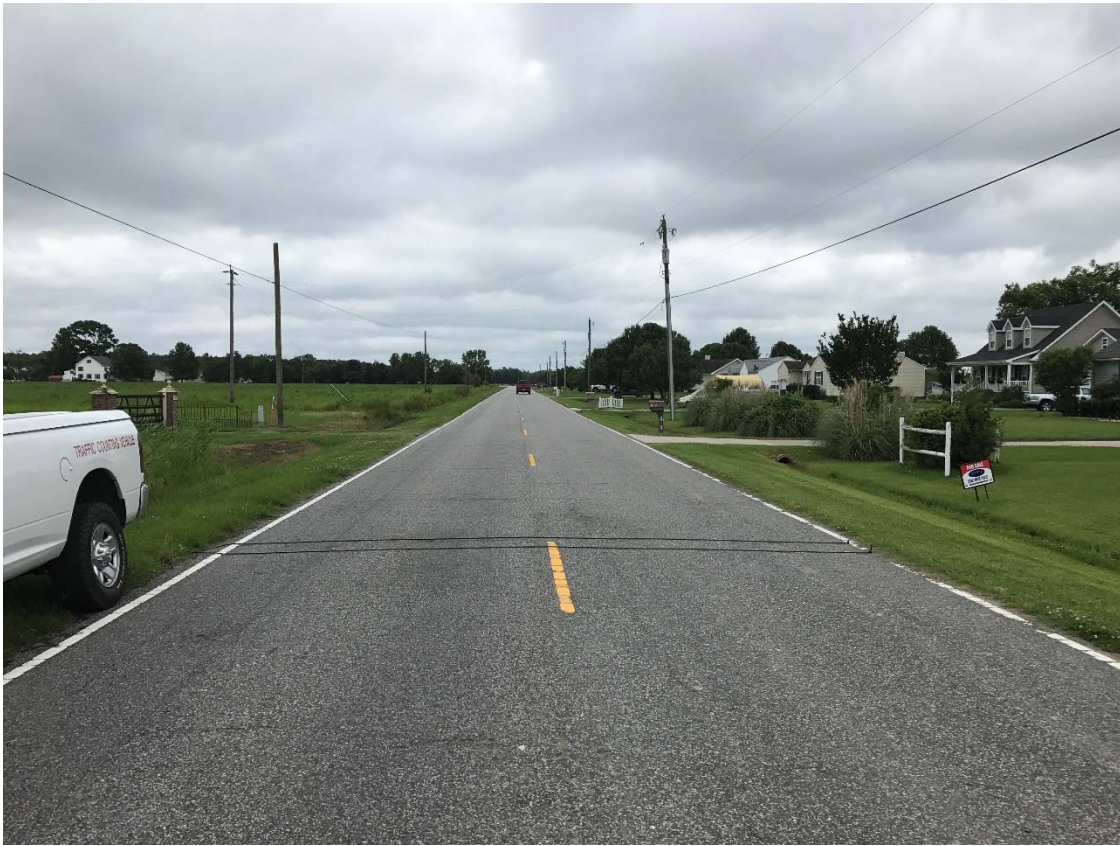
Looking in the Eastbound Direction