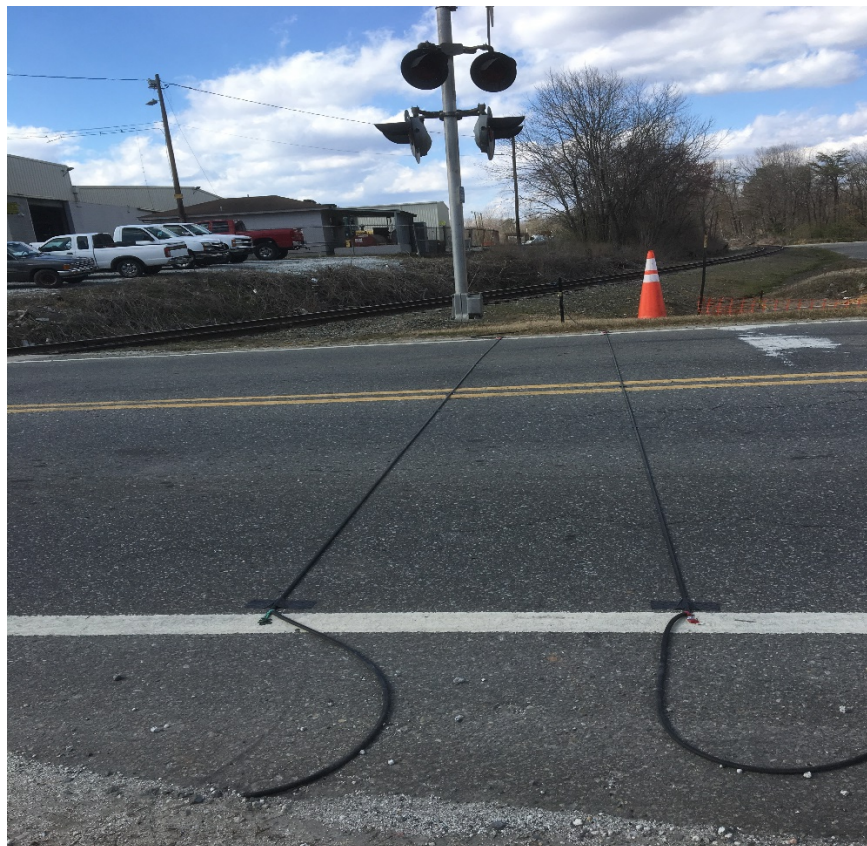
Picture of where the Tubes Tie Off

Burns Service Inc. 3840 Hahn Scott Road Mount Pleasant, NC 28124 704-526-7241