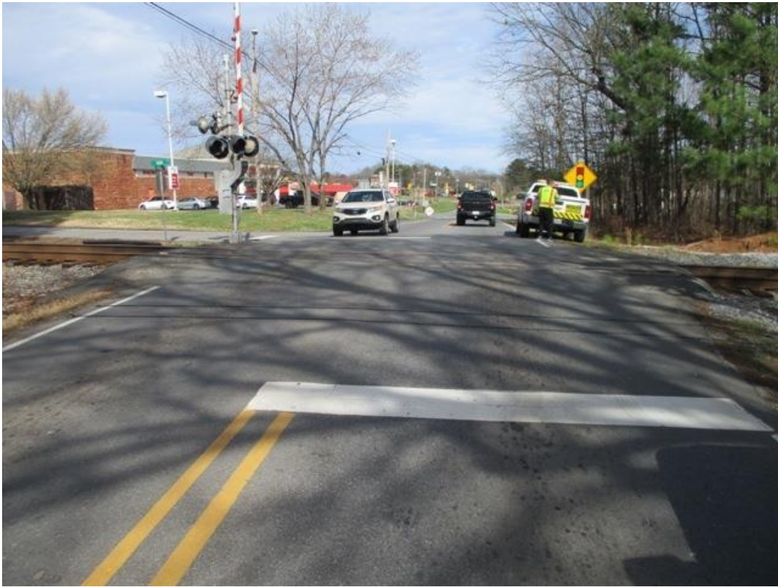
Looking in the Eastbound Direction facing the tracks