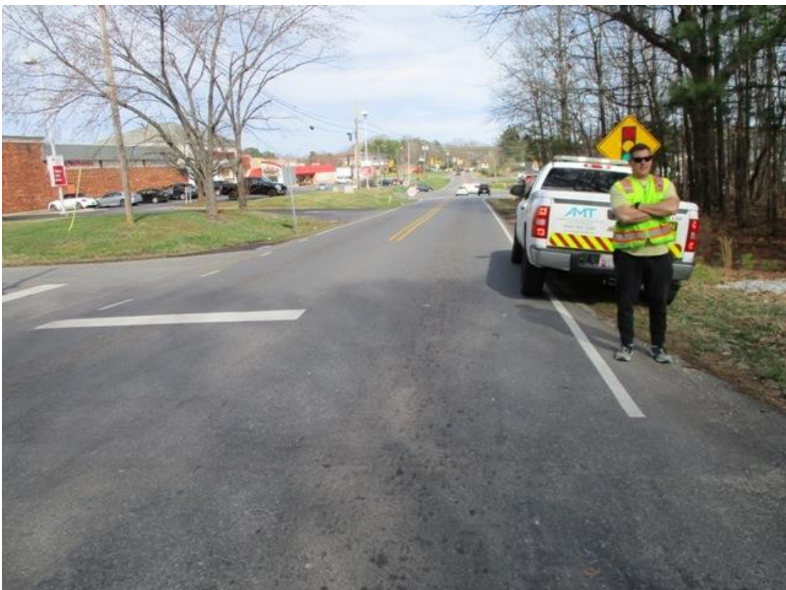
Looking in the Eastbound Direction away from the tracks