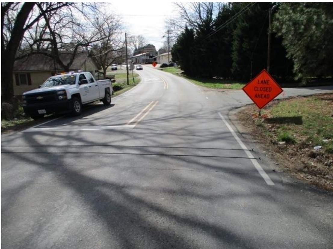
Looking in the Westbound Direction away from the tracks