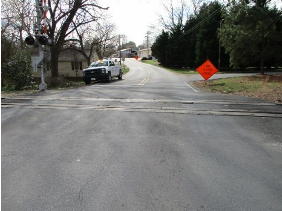
Looking in the Westbound Direction facing the tracks