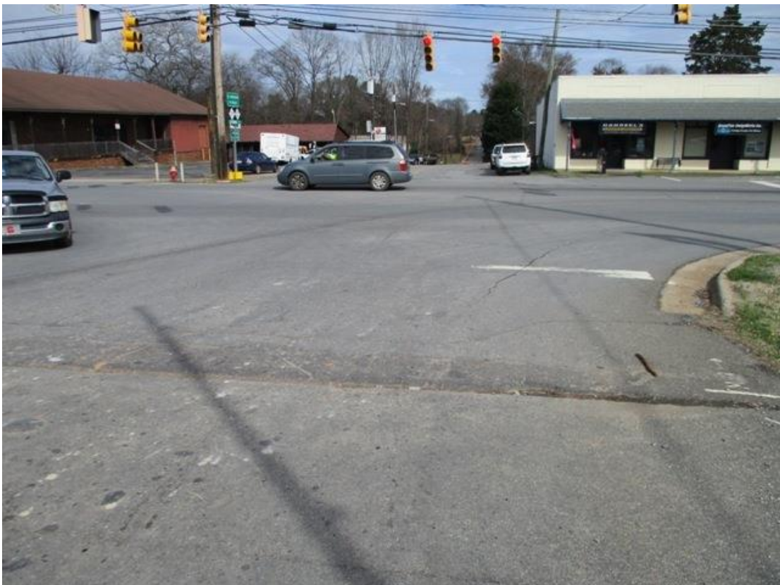
Looking in the Eastbound Direction away from the tracks