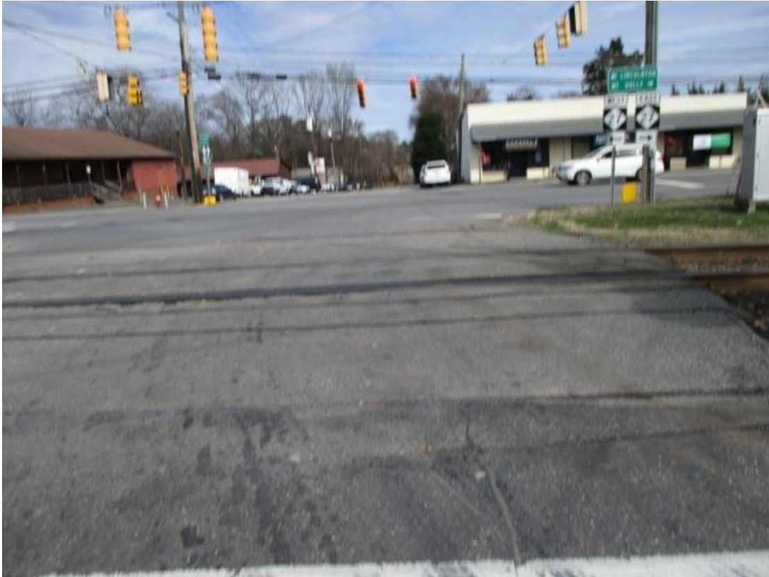
Looking in the Eastbound Direction facing the tracks