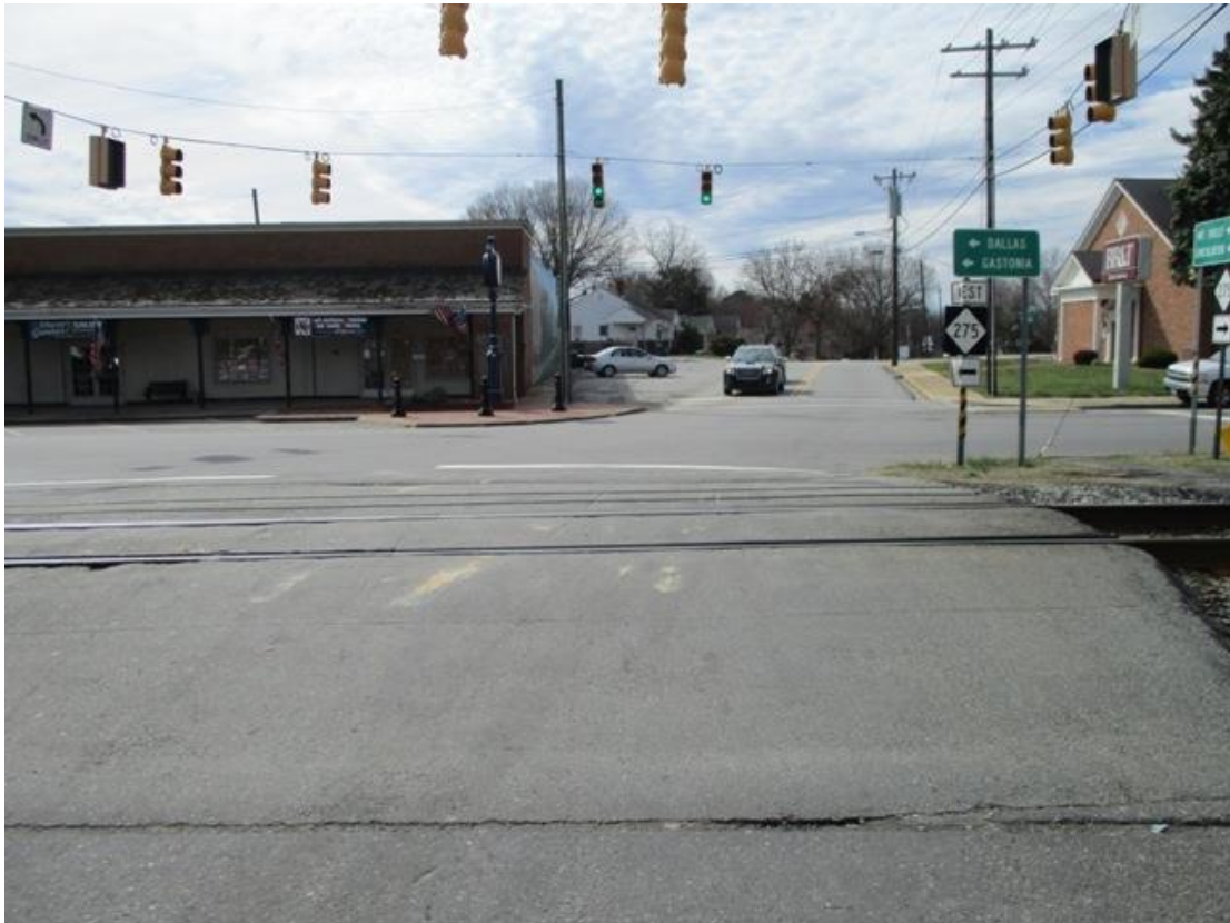
Looking in the Westbound Direction facing the tracks