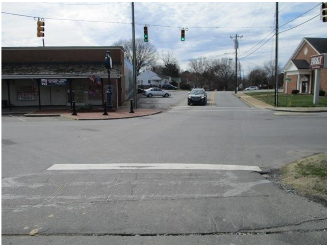
Looking in the Westbound Direction away from the tracks