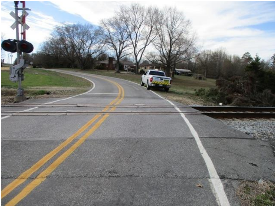
Looking in the Westbound Direction facing the tracks