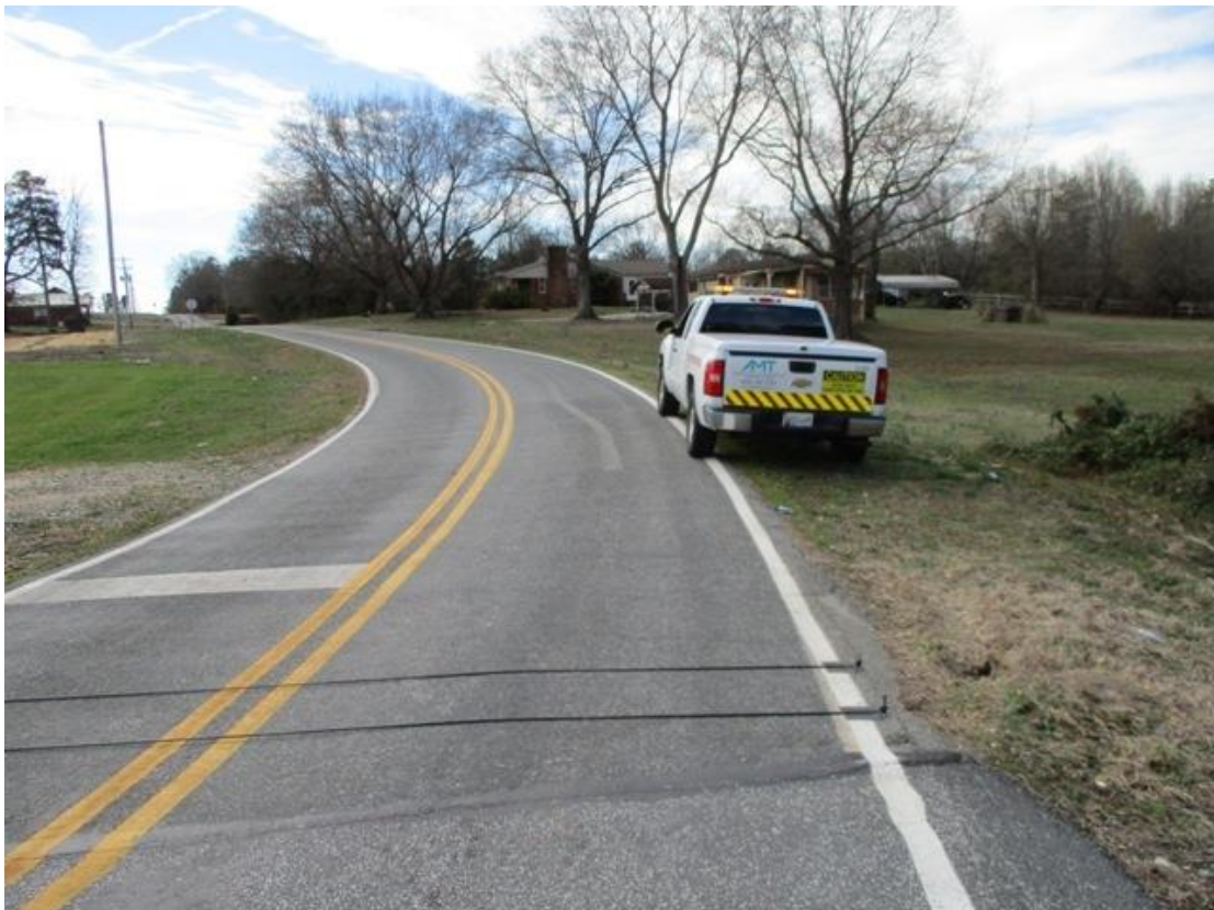
Looking in the Westbound Direction away from the tracks