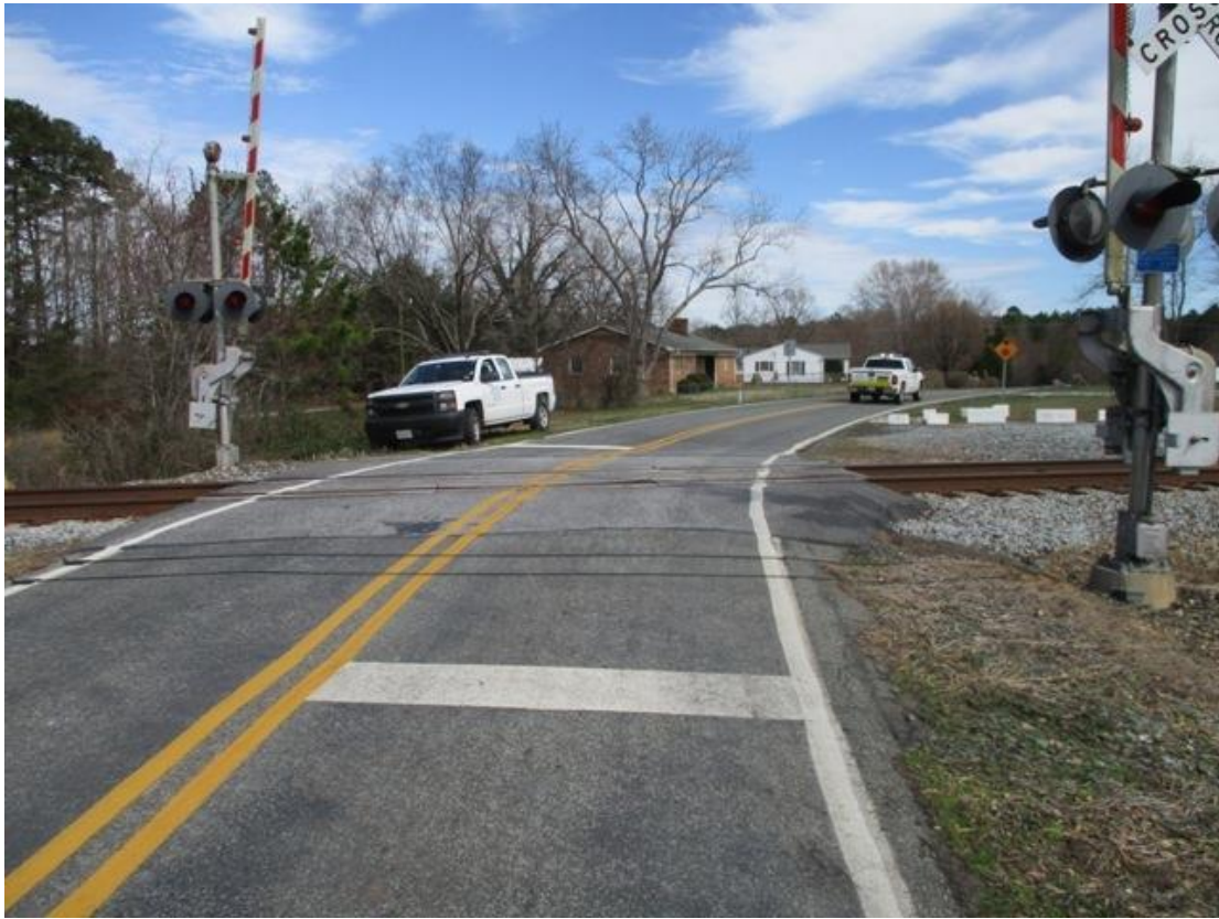
Looking in the Eastbound Direction facing the tracks