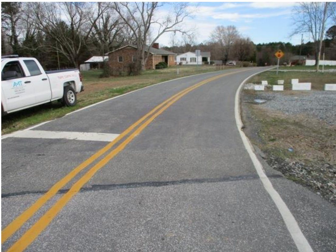
Looking in the Eastbound Direction away from the tracks