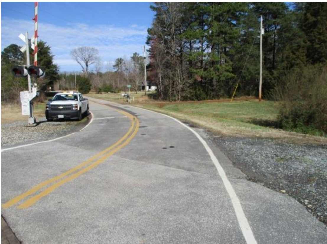
Looking in the Eastbound Direction away from the tracks