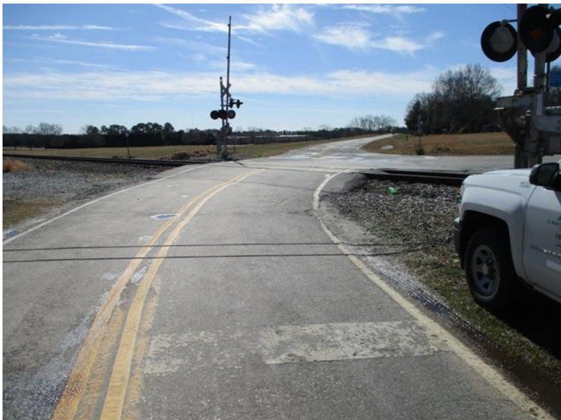
Looking in the Westbound Direction away from the tracks