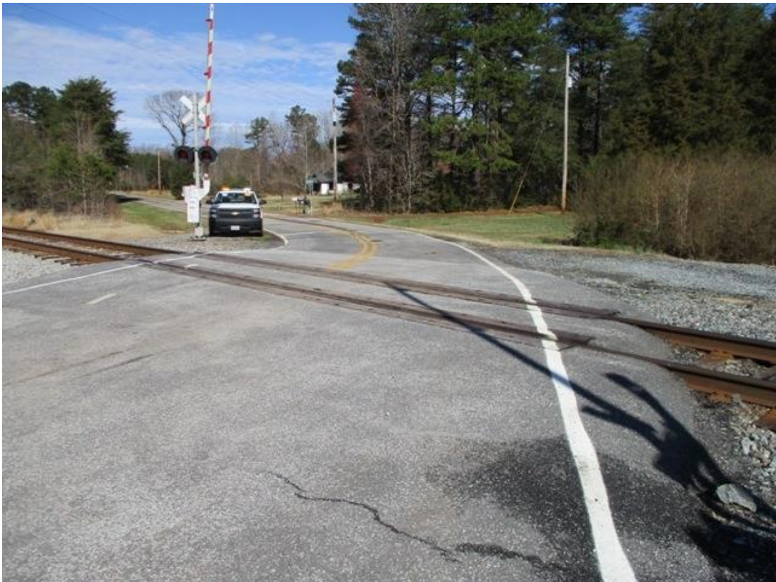
Looking in the Eastbound Direction facing the tracks