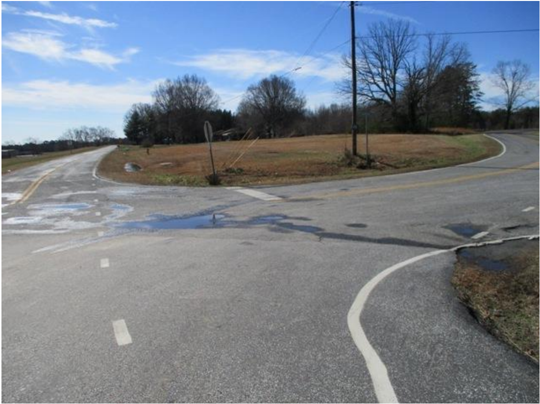
Looking in the Westbound Direction facing the tracks