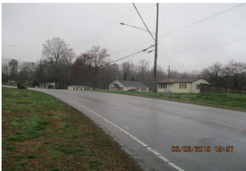
Looking Southbound From South Leg