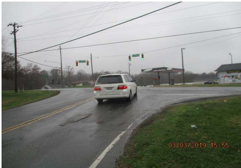
Looking Westbound From East Leg