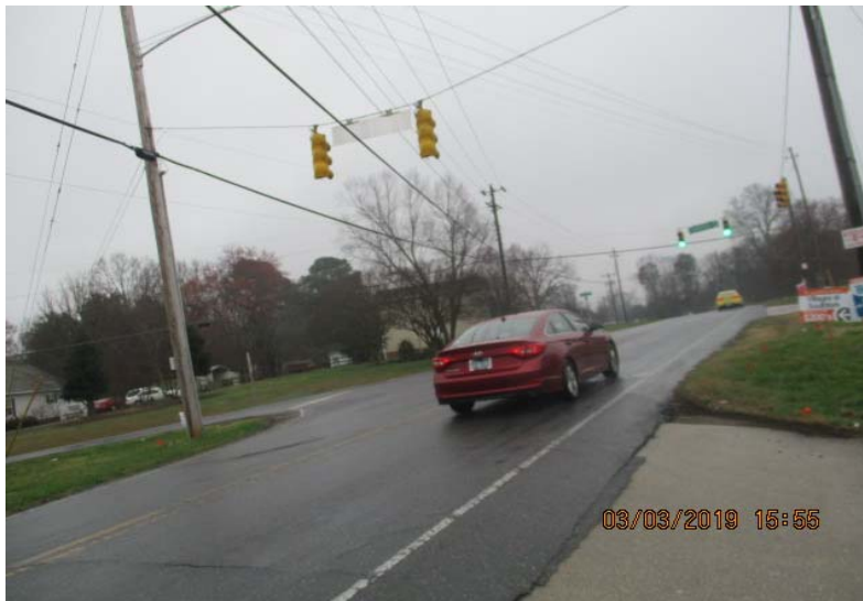
Looking Southbound From North Leg