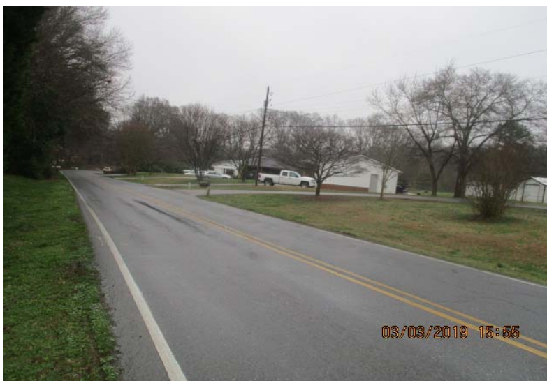
Looking Eastbound From East Leg