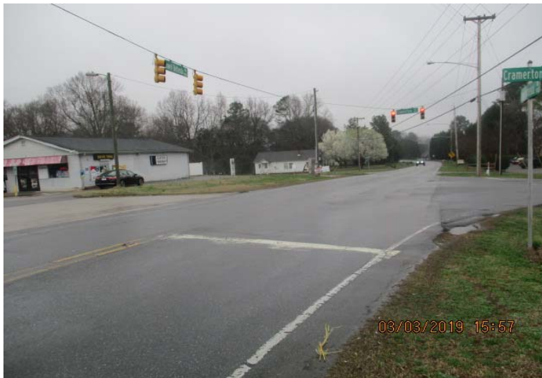
Looking Northbound From South Leg