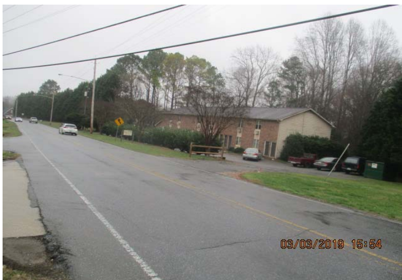
Looking Northbound From North Leg