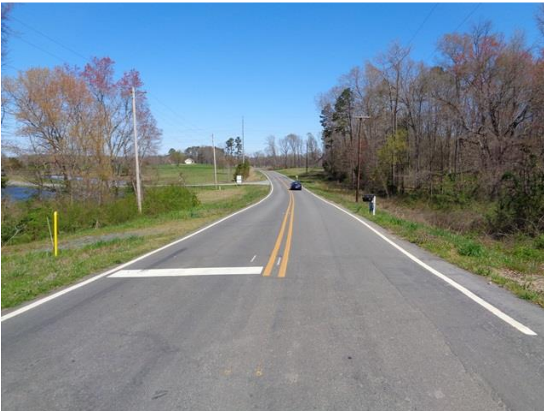
Looking in the Northbound Direction away from the tracks