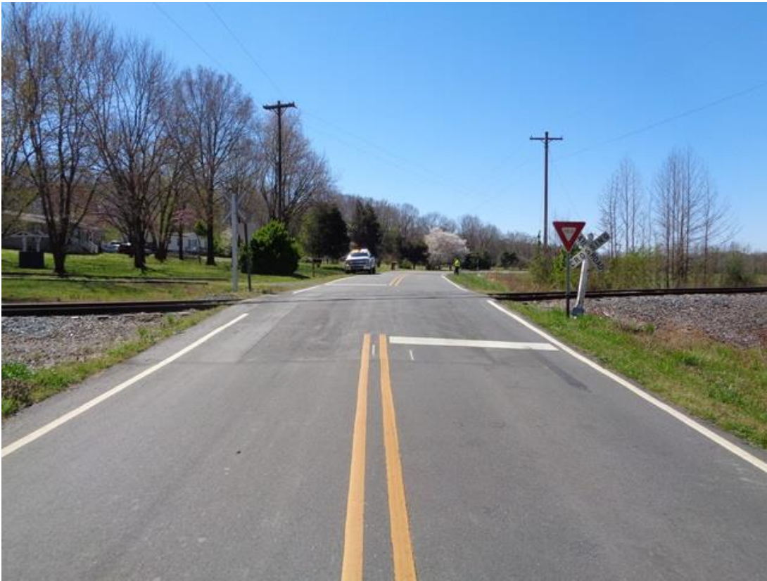
Looking in the Southbound Direction facing the tracks