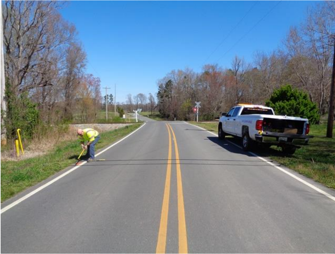
Looking in the Northbound Direction facing the tracks