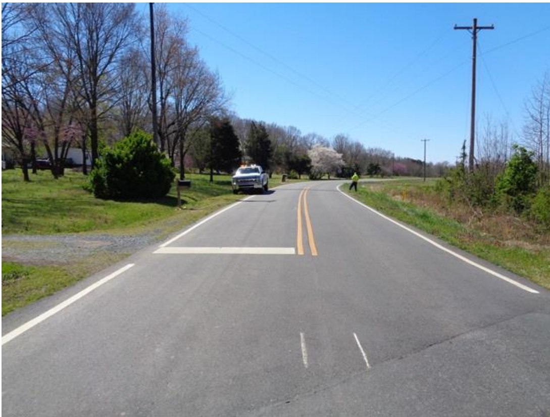
Looking in the Southbound Direction away from the tracks