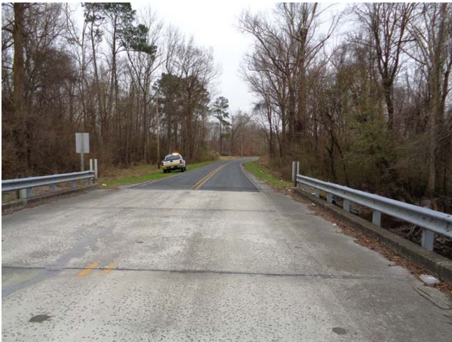
Facing Southbound at Tube