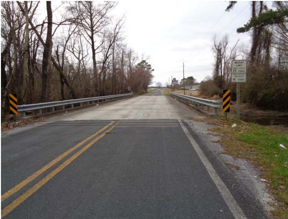
Northbound Approach and Tube