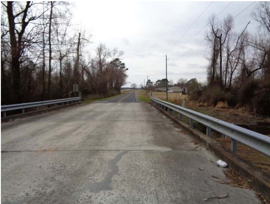
Northbound on Bridge