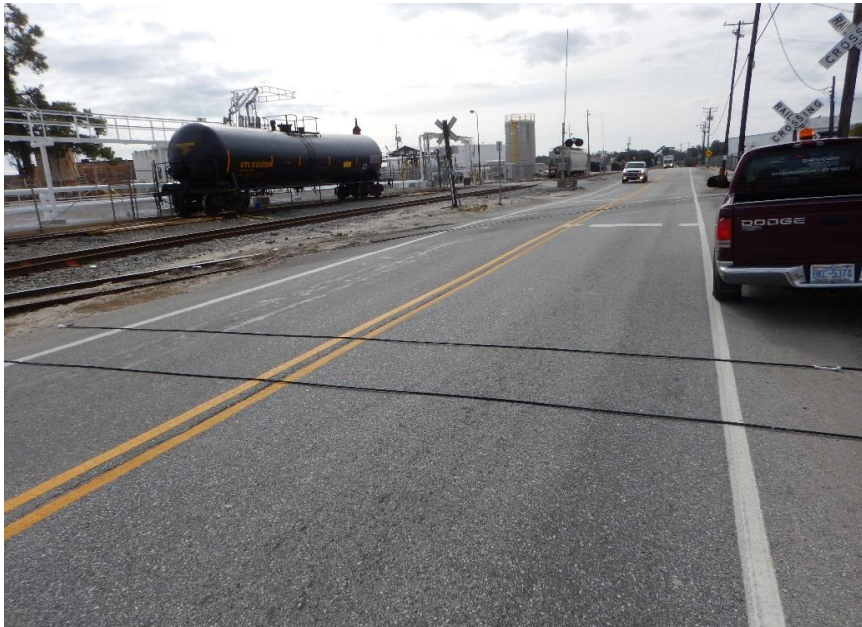
Facing South Toward Location