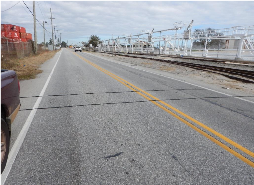
Facing North Toward Location