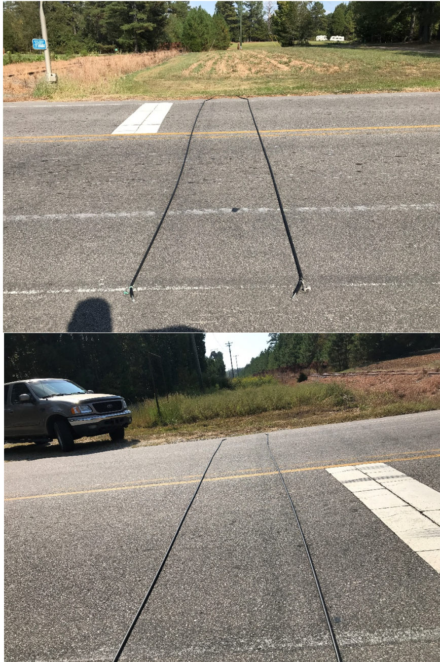
Picture of where the Tubes Tie Off

Burns Service Inc. 3840 Hahn Scott Road Mount Pleasant, NC 28124 704-526-7241