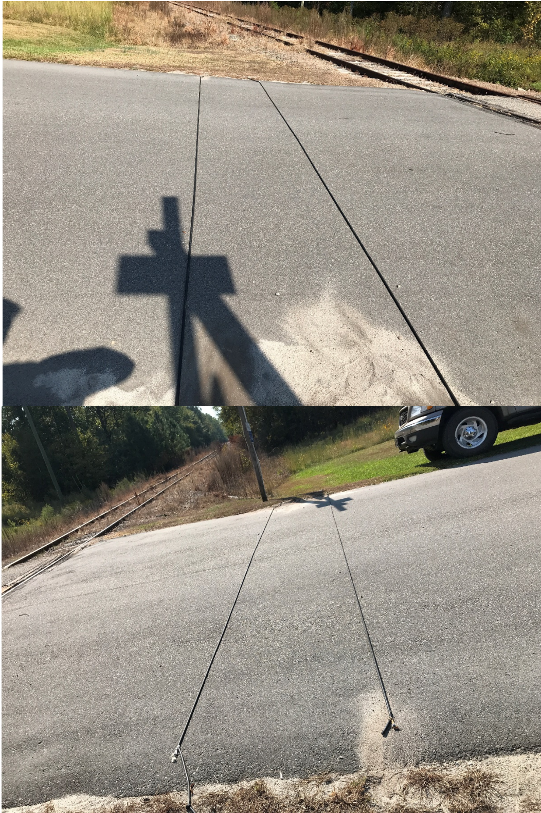
Picture of where the Tubes Tie Off

Burns Service Inc. 3840 Hahn Scott Road Mount Pleasant, NC 28124 704-526-7241