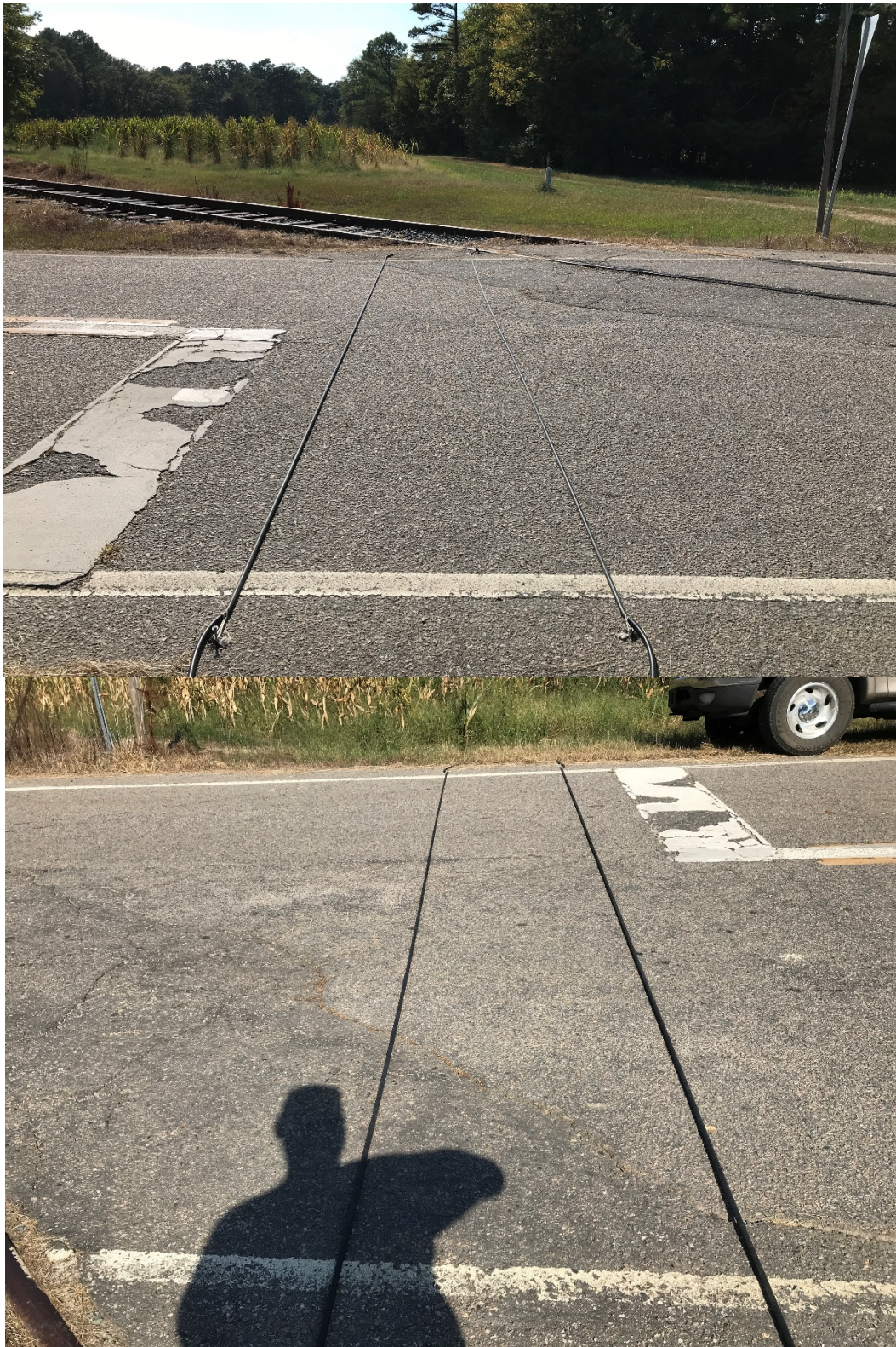
Picture of where the Tubes Tie Off

Burns Service Inc. 3840 Hahn Scott Road Mount Pleasant, NC 28124 704-526-7241