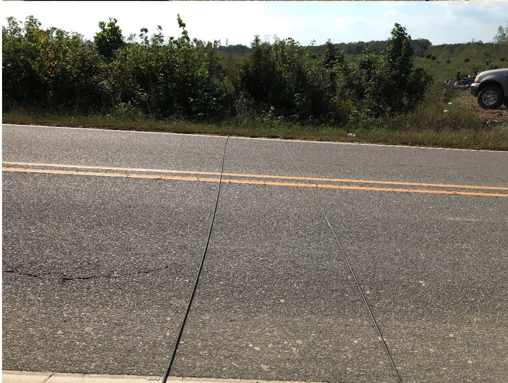
Picture of where the Tubes Tie Off

Burns Service Inc. 3840 Hahn Scott Road Mount Pleasant, NC 28124 704-526-7241