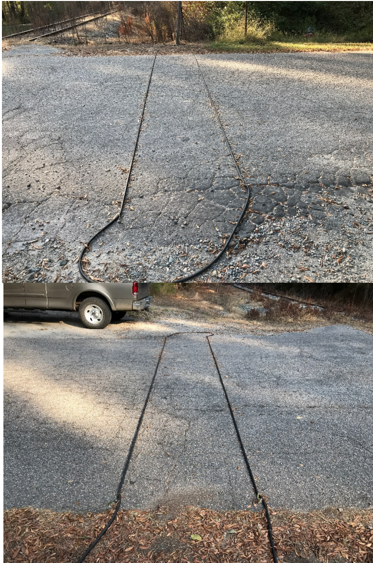
Picture of where the Tubes Tie Off

Burns Service Inc. 3840 Hahn Scott Road Mount Pleasant, NC 28124 704-526-7241