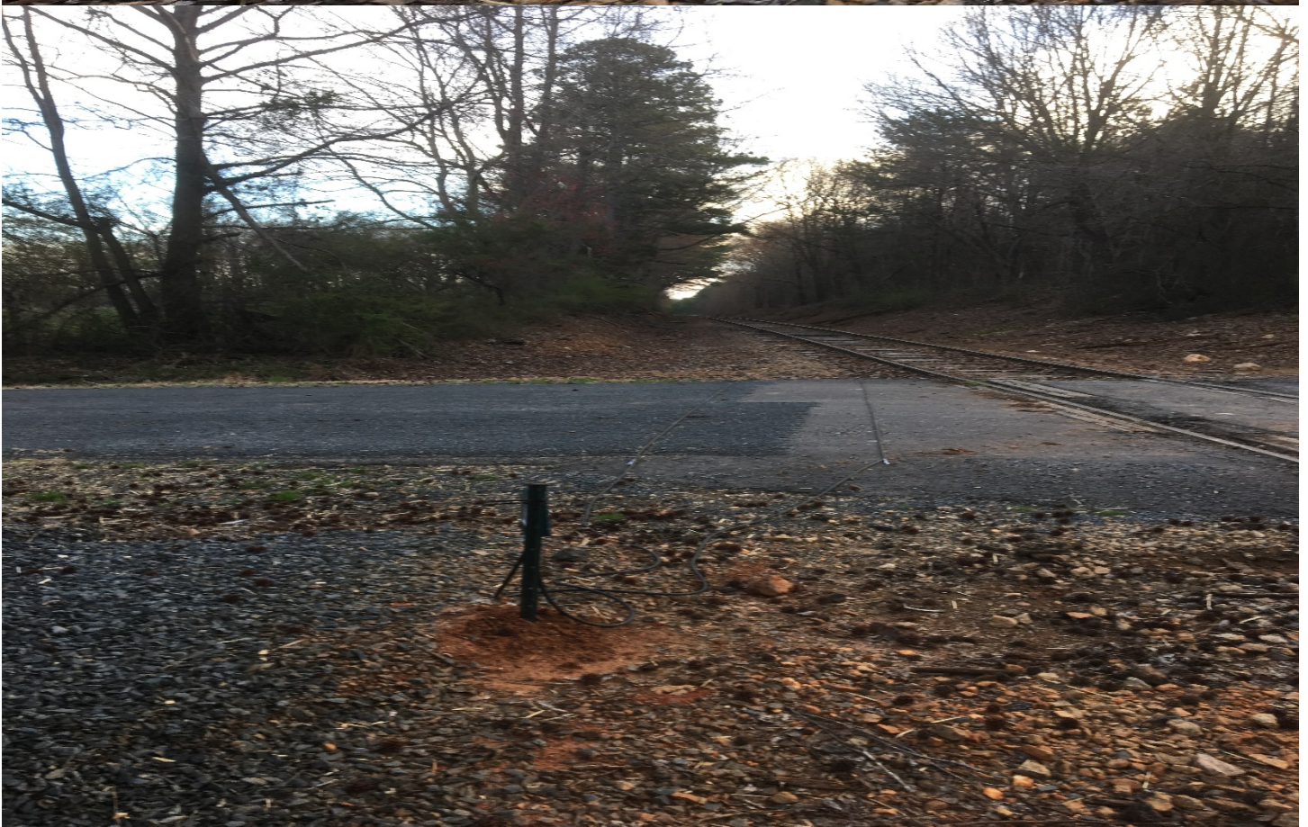
Picture of where the Tubes Tie Off

Burns Service Inc. 3840 Hahn Scott Road Mount Pleasant, NC 28124 704-526-7241